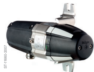
Dräger PIR 7200 Configurable IR gas detector for reliable detection of carbon dioxide