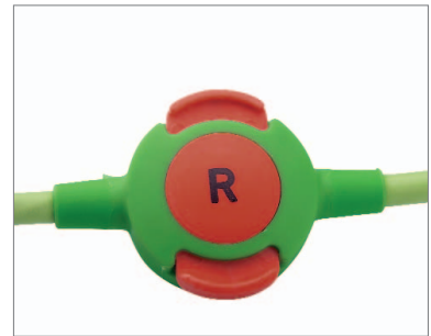
Patented Z-Snap™ Zero-Insertion Force Electrode Snaps