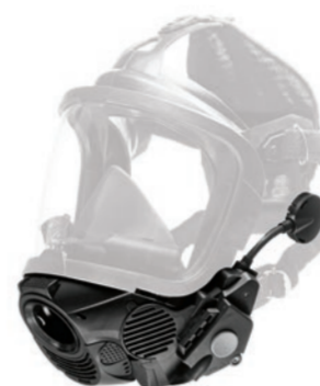
Dräger FPS®-COM 5000