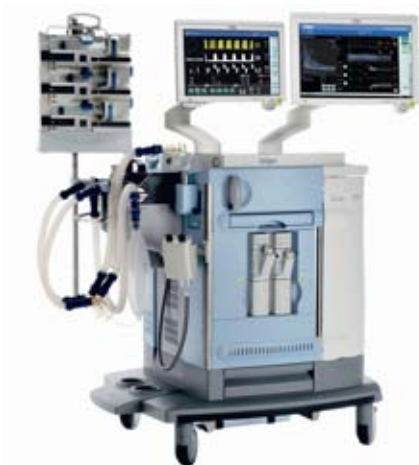
Fig.: Anaesthesia system Zeus IE in combination with SmartPilot View

device, the use of the standard anaesthesia device produces general anaesthesia consumption levels of 0.34 ml desflurane, 1772 ml O 2 and 618 ml N 2 O per minute. In contrast, the consumption levels in the case of a Zeus general anaesthesia are considerably lower: 0.14 ml desflurane, 767 ml O 2 and 173 ml N 2 O per minute. Assuming that an operation lasts on average 61 minutes, the use of standard technology to perform the general anaesthesia produces total consumption levels of 20.74 ml desflurane, 108,092.00 ml O 2 and 37,698.00 ml N 2 O per operation. The Zeus general anaesthesia, on the other hand, produces lower total consumption levels of 8.54 ml desflurane, 46,787.00 ml O 2 and 10,553.00 ml N 2 O per operation. At average prices per litre of 541.67 euros for desflurane, 0.0008 euros for O 2 and 0.0045 euros for N 2 O, the total ongoing cost per operation for a standard general anaesthesia is 11.49 euros, whilst this figure is 4.71 euros for a Zeus general anaesthesia.