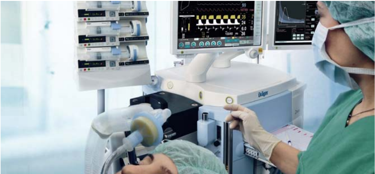
Fig.: Anaesthesia system Zeus IE in combination with SmartPilot View