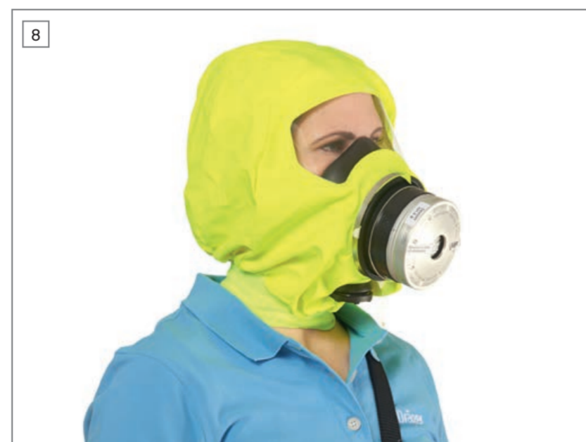
Check the fit of the half mask by closing the front filtering opening with the palm of your hand. If negative pressure is not generated readjust the half mask to ensure a close fit over nose and mouth.