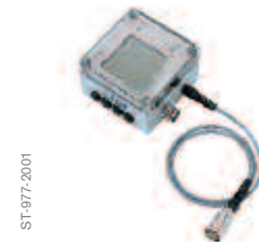
Hand Held Terminal (HHT) For easy alignment.