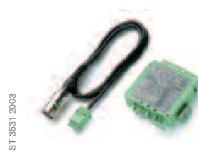
AI500 and Adapter Cable Digital interface to HHT or a PC.