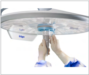
Flap as a removing mechanism