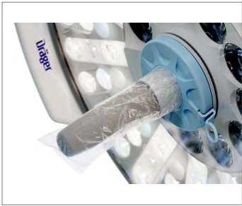
Disposable Handle Polaris