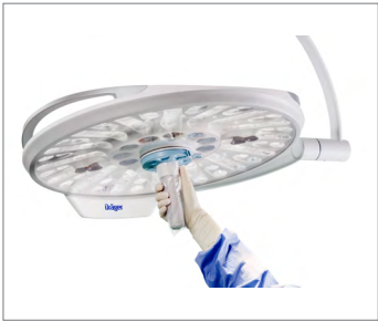
Disposable Handle supports Polaris STC function