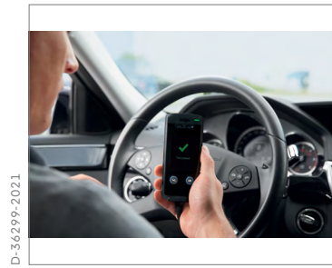
Breath sample accepted: Starter is enabled