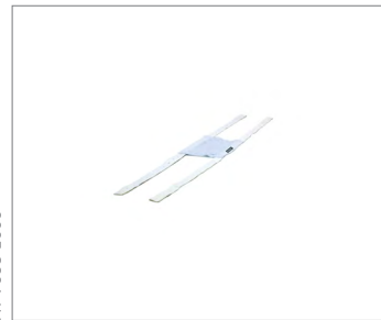
Headgear, soft rubber