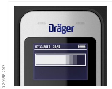
"Test Progress Display" symbol