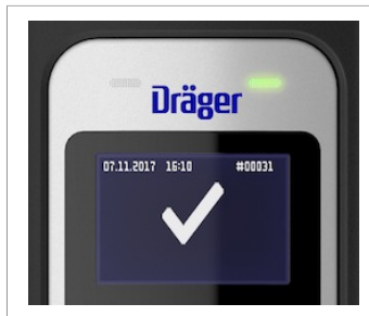
"No Alcohol Detected" symbol