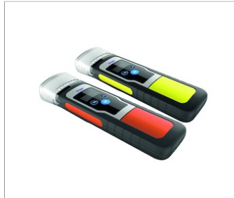
Optional reflector film set (yellow or orange)