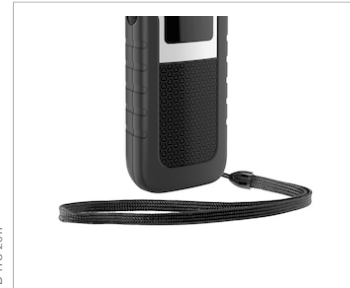
Grips and wrist-straps for secure holding