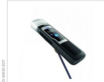
1/4" thread for mounting a selfie stick