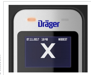
"Alcohol Detected" symbol