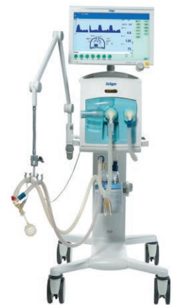
The Babylog® VN500 with Infinity® Medical Cockpit™ C500

The Dräger Mandatory Minute Volume (PC-MMV) mode is based on conventional pressure-controlled synchronized intermittent mandatory ventilation. By continuously analyzing volume and flow