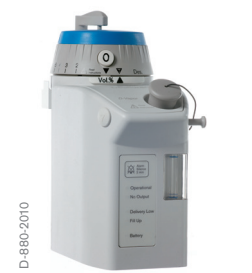
Dräger Vapor 2000 - sevoflurane