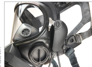
MS-COM communication system

You can be confident in the seal provided by the DHR 7000 because it has a triple sealed edge, and the wide field of vision enables optimal situational awareness.