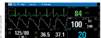
Infinity® M540 portable monitor screen