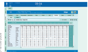
Medical Cockpit® IT application screen