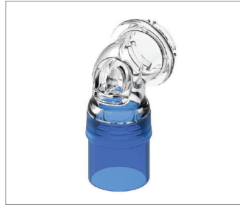
Nonvented mask with an anti-asphyxia valve for use with single limb circuits