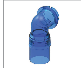
Nonvented mask for use with dual limb circuits