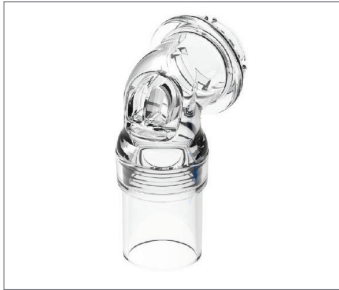
Vented mask with an anti-asphyxia valve for use with CPAP or bi-level devices

A full line of disposable masks to meet your NIV needs, color-coded for easy identification.