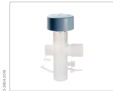
HI-Flow Star Valve