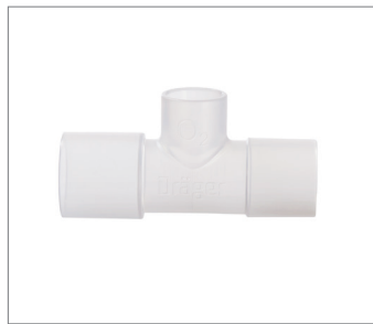
T-piece MX300/MX300i, 22mm