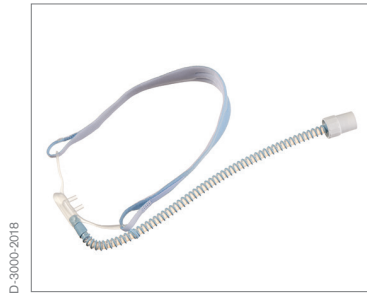
HI-Flow Star Nasal Cannula