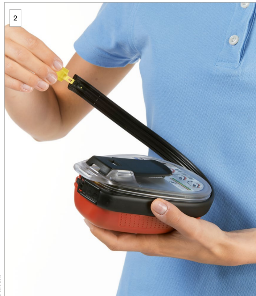
2 Remove the sealing band.