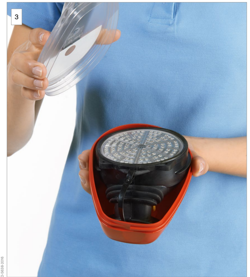
3 Open the case.