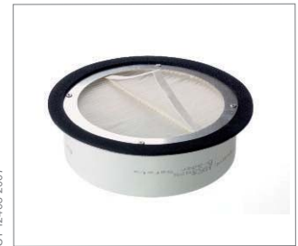
Dräger NBC airborne-particulate filter